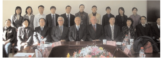
China - Indonesia, Page 3