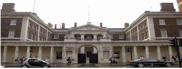
Project Group: The Human Factor in Global Governance, Page 2